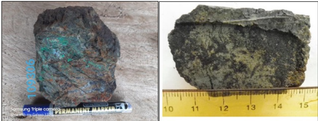
Figure 3: Mineralized rock float samples at Everi Creek. Left: Sample #109306 which is an ultramafic rock with strong malachite coatings and veins of quartz, pyrite and chalcopyrite assaying 2.88% Cu, 0.328 g/t Au, 4.4 g/t Ag and 1 ppm Mo. Right: Sample #109307 which is a clinopyroxene-rich Cu-Au skarn with assay values of 0.9% Cu and 0.21 g/t Au. See Figure 2 for location.