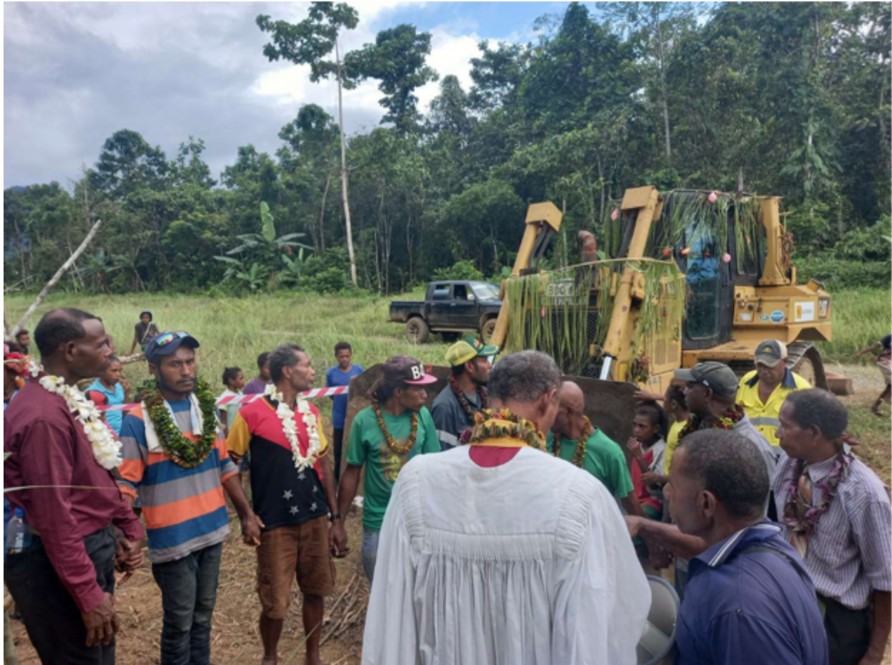
Figure 4: Ground-breaking celebration for construction of the 30 km access road to the drill site and camp. Local Doma Village residents shared in the excitement of developing this new infrastructure.